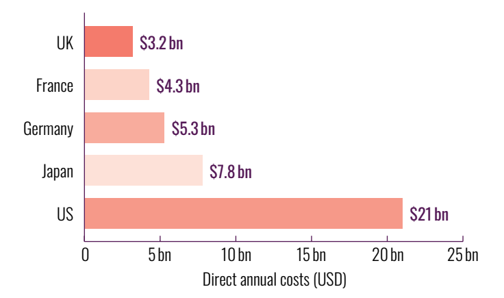
Figure 2. Estimated direct annual costs of heart failure in five countries, 2014<sup>14</sup>

6 // Preventing hospital admissions in heart failure